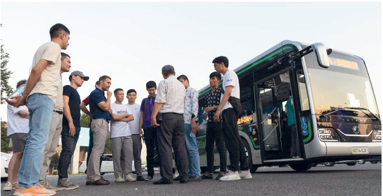
Study tours to renewable energy sites

During the implementation of the project Phase II in 2022, the youth focused activities were culminated with formulated of Uzbekistan's Youth Statement through working in groups, discussing the required measures and actions that they can contribute or implement to achieve the ambitious climate targets committed by Uzbekistan to contribute to the global GHG emission reductions pledges committed under the ratified Paris Agreement.