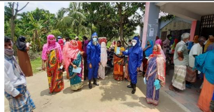
Photo 3: Village police wearing PPE and performing their duty while distributing VGF/VGD

EALG's COVID-19 response initiatives reduce the potential threat of infection, build confidence among stakeholders and help to engage them in COVID 19 response initiatives with support from the government and other stakeholders. The UP representatives, Secretary, Gram Police, community clinic members, Ward Committee members, and local residents have been benefited through the COVID 19 response initiatives.