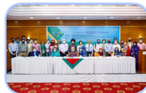
Inter-Ministerial Consultation on Revised Mapping