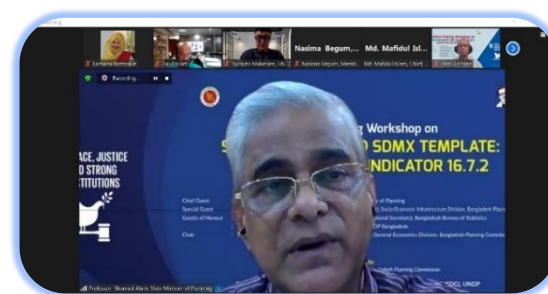
Training on SDG Indicator 16.7.2