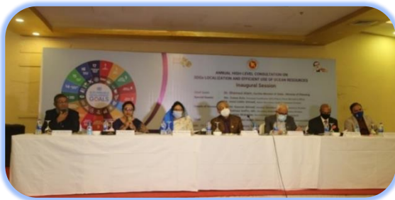
High-Level Consultation on SDG Localization and Efficient Use of Ocean Resources