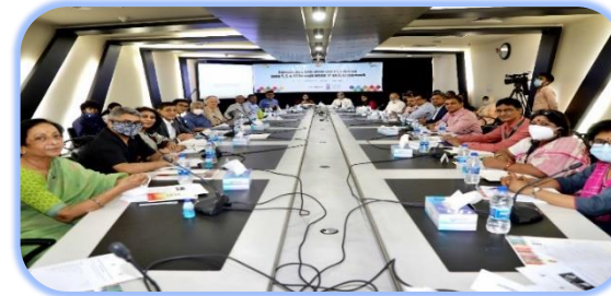
Consultation with Wider Stakeholders on SDGs 5, 8, and 13 through the Whole of Society Approach