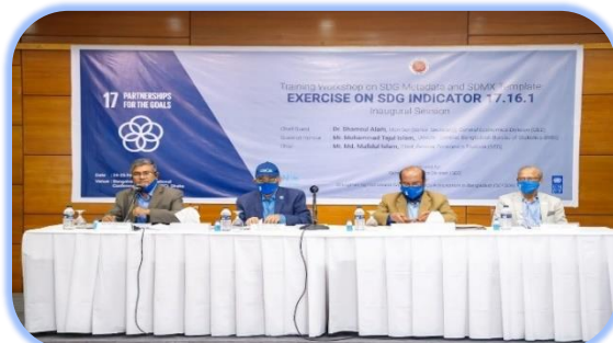
Training on SDG Indicator 17.16.1