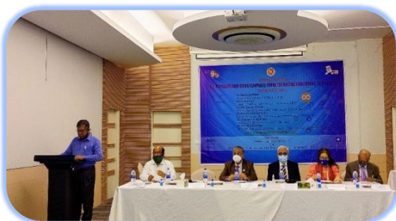
Training on SDG Indicator 12.2.1 & 12.2.2