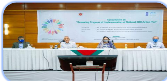
Second Review Workshop on National SDG Action Plan