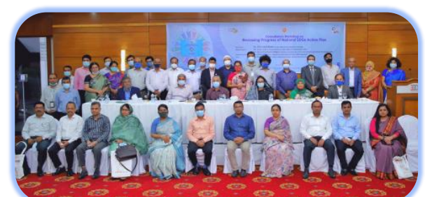
Third Review Workshop on National SDG Action Plan