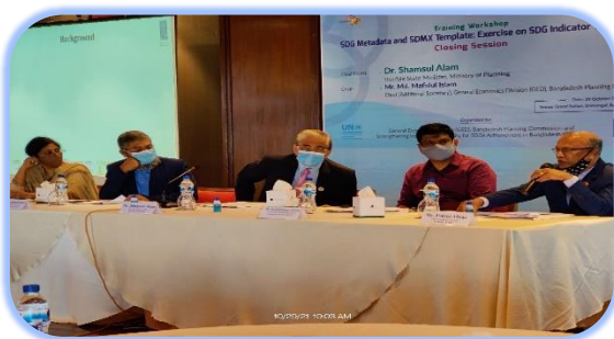
Training on SDG Indicator 17.15.1