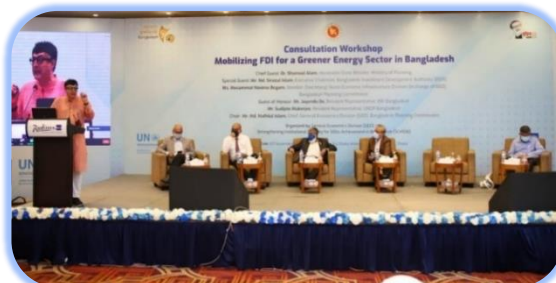
Workshop on “Mobilizing FDI for a Greener Energy Sector in Bangladesh”