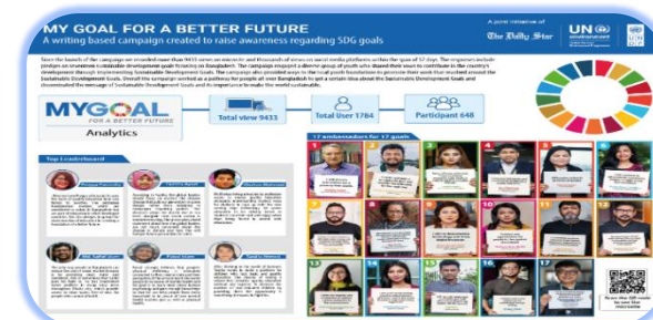
Online campaign “My Goal”