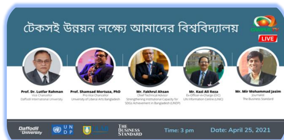
Online webinars on the role of academia in achieving the SDGs