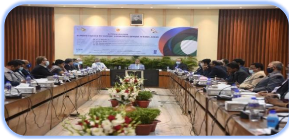
National Dialogue on "Blended Finance to Support Green Development in Bangladesh"